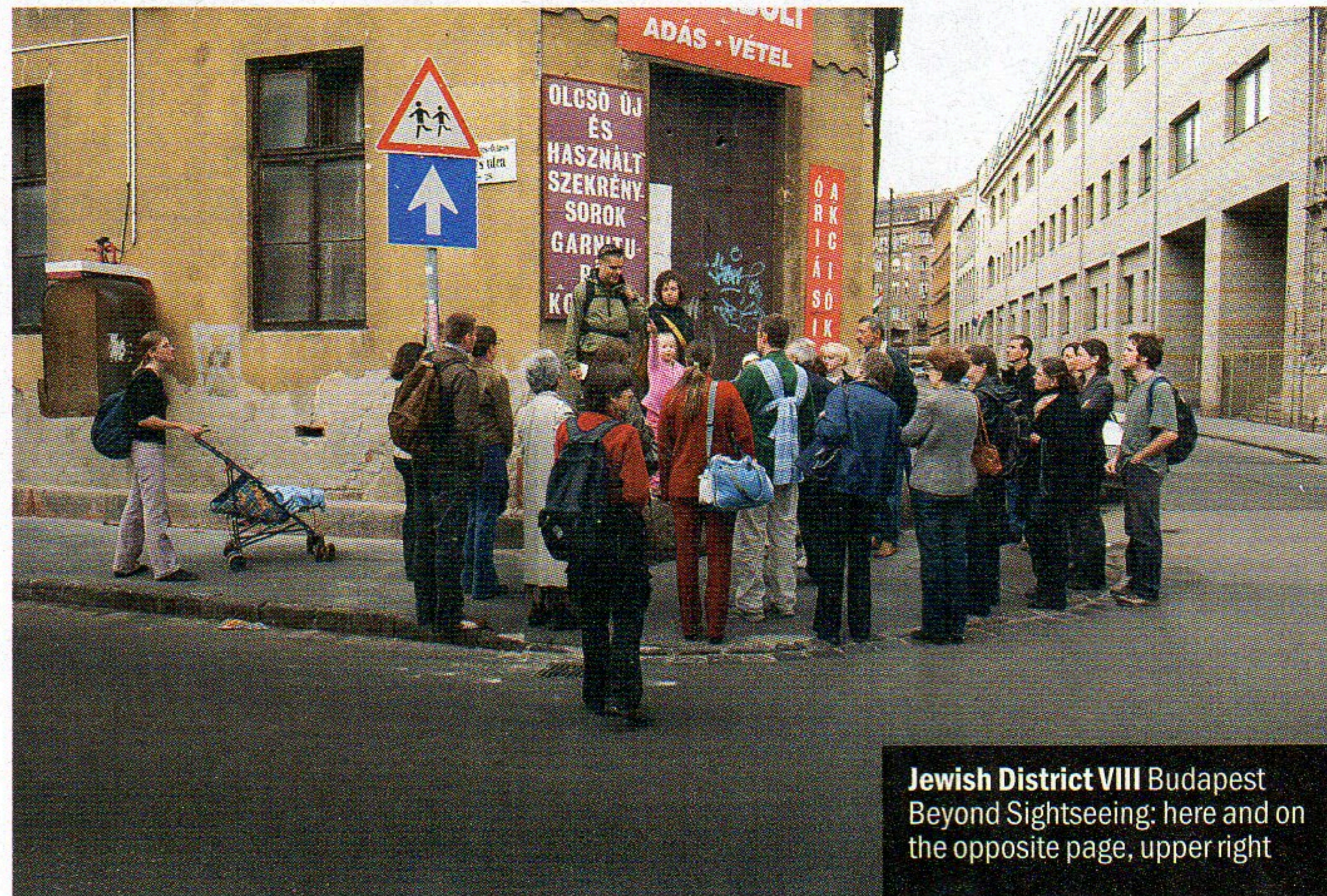
Jewish District VIII Budapest Beyond Sightseeing: here and on the opposite page, upper right

Along with 13 walking tours, UniqueBudapest also offers an interactive sightseeing game, called the Budapest Code, which