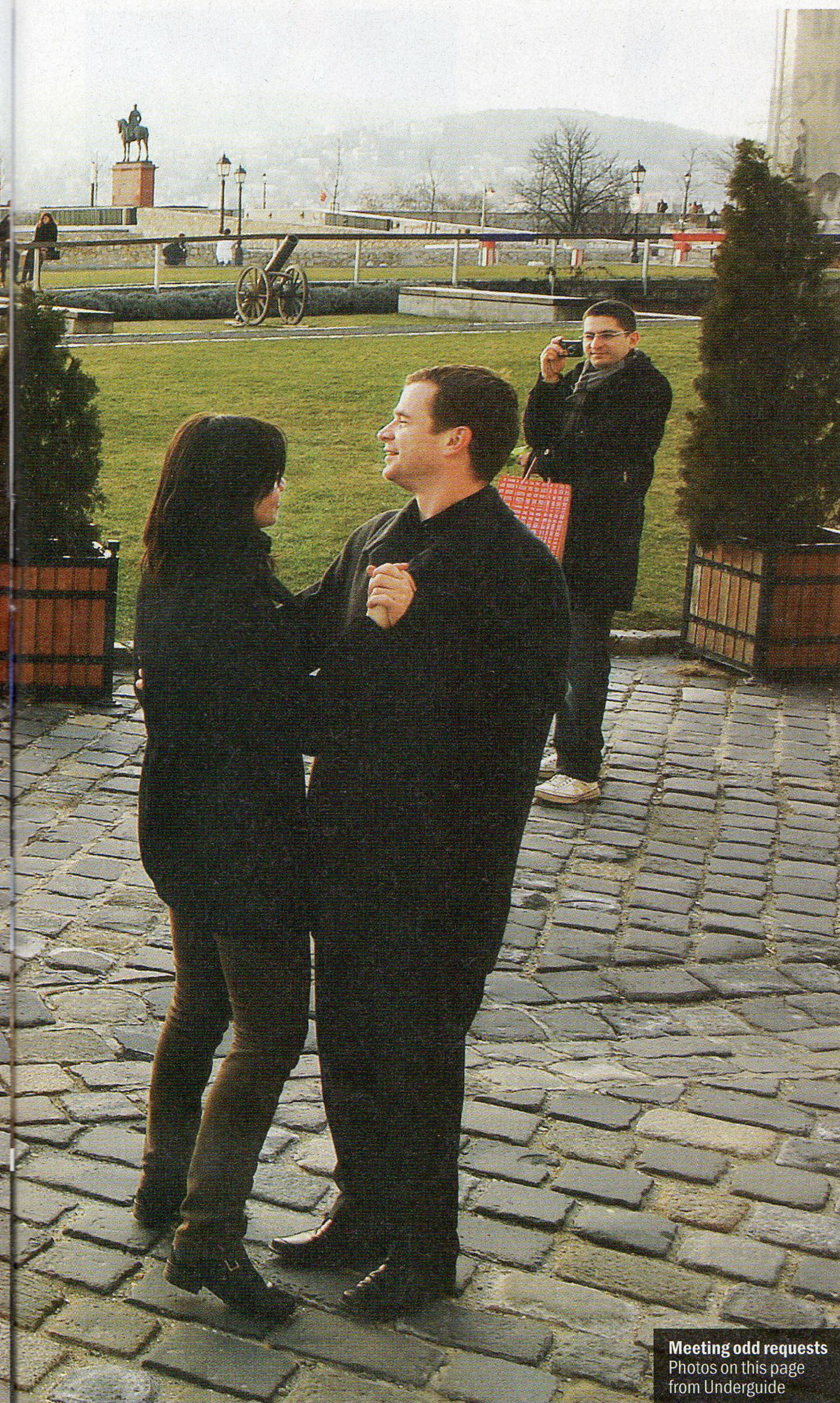
Meeting odd requests